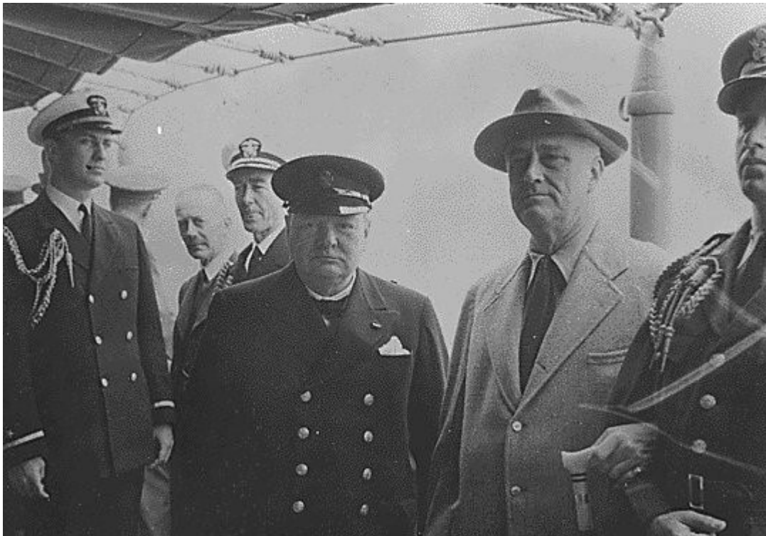
On 19 August 1941, Churchill told his war cabinet that Roosevelt was doing all he could to provoke an attack by the Axis powers. Photo: August 1941.